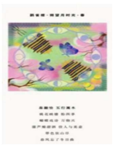
Figure 7: Digital collection on Stork Tower Moon time series.

has played a good demonstration effect on the protection and utilization of spatial cultural heritage, and also provided more possibilities for the exploration of the renewal and transformation of urban traditional humanistic space.