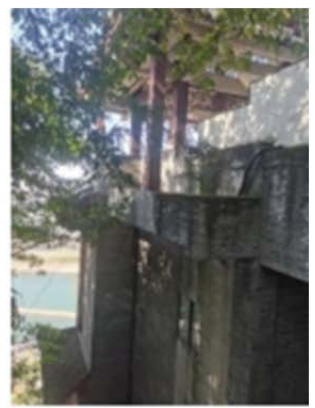
Figure 8: Piled landscape in the interland of Fotuguan Park.