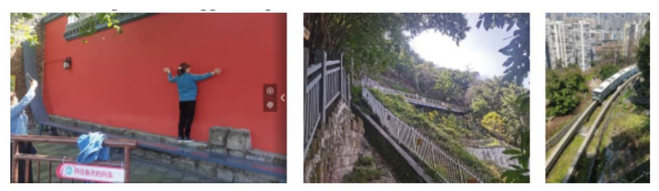
Figure 10: Top of Fotuguan Park into park wall and foot of the light rail network red landscape (Photo source: By the author).