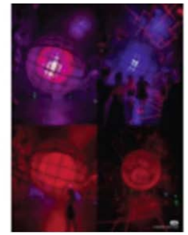
Figure 14: Image of light and shadow transformation of air raid shelter space.