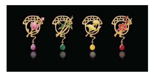
Figure 3: Inspired by the characteristics of the cottage architecture and the four seasons of flowers in the courtyard of the cottage jewelry (photo source: Du Fu Cottage Literary creation.

Du Fu's Thatch Cottage(Cao Tang), Wuhou earl Temple and Jinsha Site have been the three major cultural hotspots in Chengdu for many years. Among them, "Du Fu", as the poet who wrote the most about Chengdu, lived in a small space, but it has great cultural appeal. Chengdu made precise use of the cultural target of Du Fu's visit to the cottage, and brought the cottage to Chengdu to develop, deepen and extend the cultural recurrence of "one person to one museum to one city". Starting from the small space point of the cottage, it continues to extend, the physical space bears the protection and utilization of the countryside space of the cottage, and the interpretation