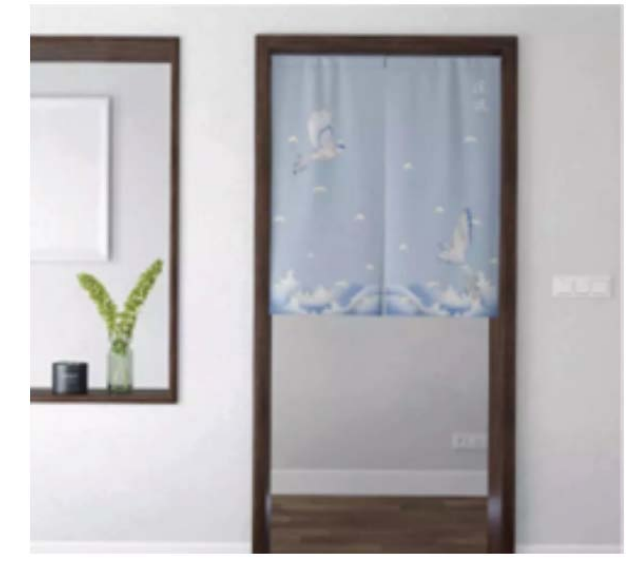
Figure 4: The curtain of "Poetic Vernacular: Canglang Series".