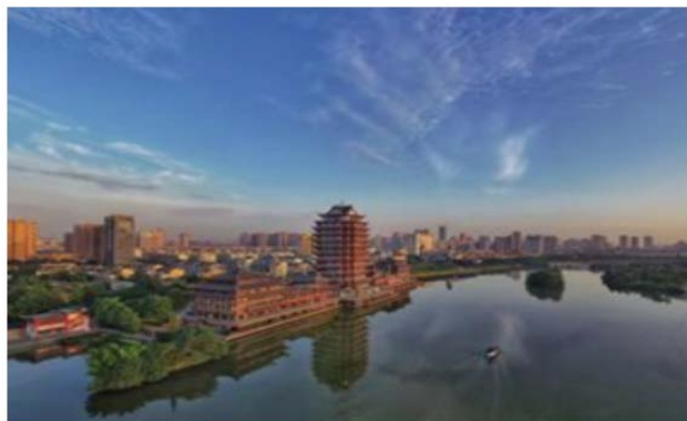
Figure 1-2: Poetic space construction of Meishan Dongpo hometown and new urban landscape Dongpo Song City.

District is promoting a total of 23 cultural tourism projects, with a total investment of more than 100 billion yuan. Dongpo and his poems have greatly promoted the construction of urban space and the development of economy and culture.