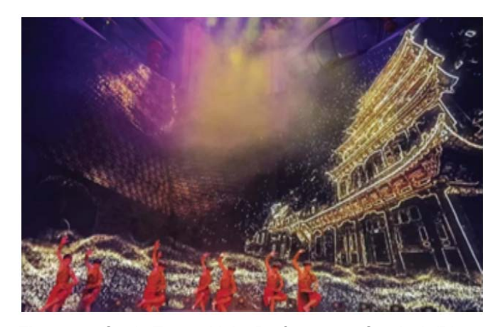
Figure 6: Stork Tower Light Performance Carnival.

A pavilion in the north, famous for a short poem, is a cultural tourism resource with a great sense of quality in Yongji, Yuncheng, Shanxi Province. After the renovation of the Stork Tower in accordance with the literature records, it not only has the poetic culture as the background, but also develops many tourism products with The Times. The resources of Wang Zhihuan and Stork Tower, which only have 6 poems in the world, are used to the extreme. In 2023 alone, it will successively launch the music and dance art of the Stork Tower Poetry Conference, the "You Sheng Tang Dream West Stork Tower Light Performance Carnival". regional cuisine, featured intangible cultural products, light show performances, Stork Tower · Shuoyuanyue time series digital collection online release, etc., integrating online and offline resources, combining horizontal and vertical, driving diversified consumption of cultural and tourism products. For the city culture brand to provide quality products. In 2023, in only five days, Stork Sparrow Building cultural and creative ice cream has an individual income of 78,000 Yuan. In addition, the reception of foreign tourists in the Guk Qiulou Scenic area increased by 80.7% compared with 2019; Ticket revenue of 1.3 million yuan, an increase of 60.4%, ranked second in Yongji region, which has many cultural and tourism resources.