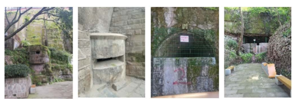
Figure 11: Empty bunkers and bomb shelters in Fotuguan Park (Photo source: By the author).

generate emotional and participatory interaction with tourists, and continue to crowd out and erode the original cultural space, which needs to be curbed.