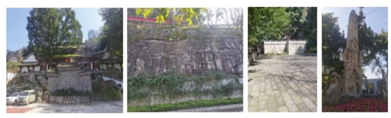
Figure 9: Fotuguan Park hinterland landscape hybrid (photo source: By the author).