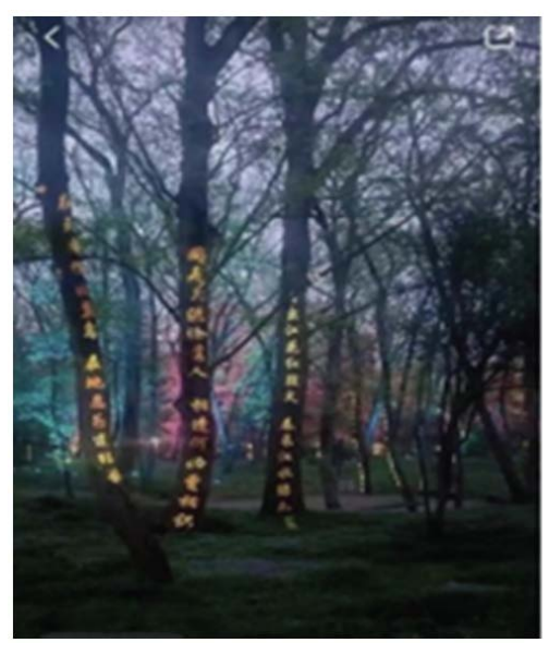
Figure 13: Bashan Night rain poem transformation intention.

narrative space, it can improve and extend the content of classic stories, give play to the integration and penetration of cultural themes. and develop characteristic products in the process of immersive experience of related scenes. From spatial behavior activities to materialized cultural creation, we should collect scene characteristics as much as possible, establish strong correlation, and realize the realization of crowd flow into industrial flow.