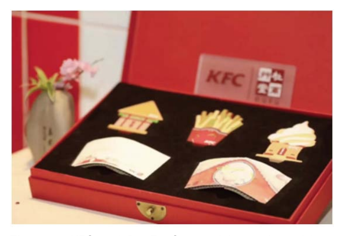
Figure 5: KFC and Du Fu Cottage joint products (photo credit: Du Fu Cottage).

The cottage not only has the heritage of ancient traditions, but also the grafting and integration of many modern products, such as crossing over with wellknown brands in other industries such as Mercedes-Benz and KFC, and exploring more possibilities through ancient and modern cooperation. For example, Caotang and KFC jointly created a Tianfu beautiful theme restaurant, the restaurant space implementation of poetic atmosphere layout, and launched a joint literary creation, launched "eating fried chicken, taste Du Fu poetry culture" modern life concept. Through such a way of advancing with The Times, the Caotang integrates traditional culture into the artistic expression of modern fashion, which not only expands the commercial space, but also lets people feel the Caotang culture and Tianfu culture imperceptibly. Culture and business complement each other in this clever collaboration. According to statistics in 2020, the annual revenue of cultural and creative products of the Caotang reaches about 12 million yuan. In the May