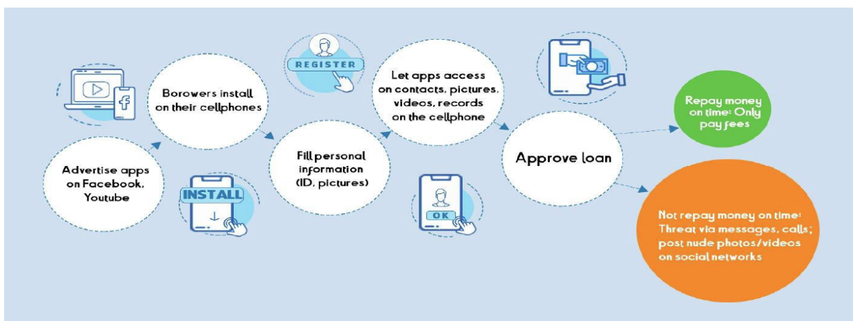
Figure 2: Steps of a loan shark on online P2P lending. (Source: To be designed and illustrated by the authors).

advantages of technology in finance to earn loan sharks. The data from interviews and case studies showed a transparent process to get a loan shark through online P2P lending in Vietnam, as described in Figure 2. However, the participants shared their experiences on specific activities of offenders in this field of crime. It means that offences in the system of online P2P lending are organized tightly. The offenders are divided into various steps with various methods, as the participants discussed belows.