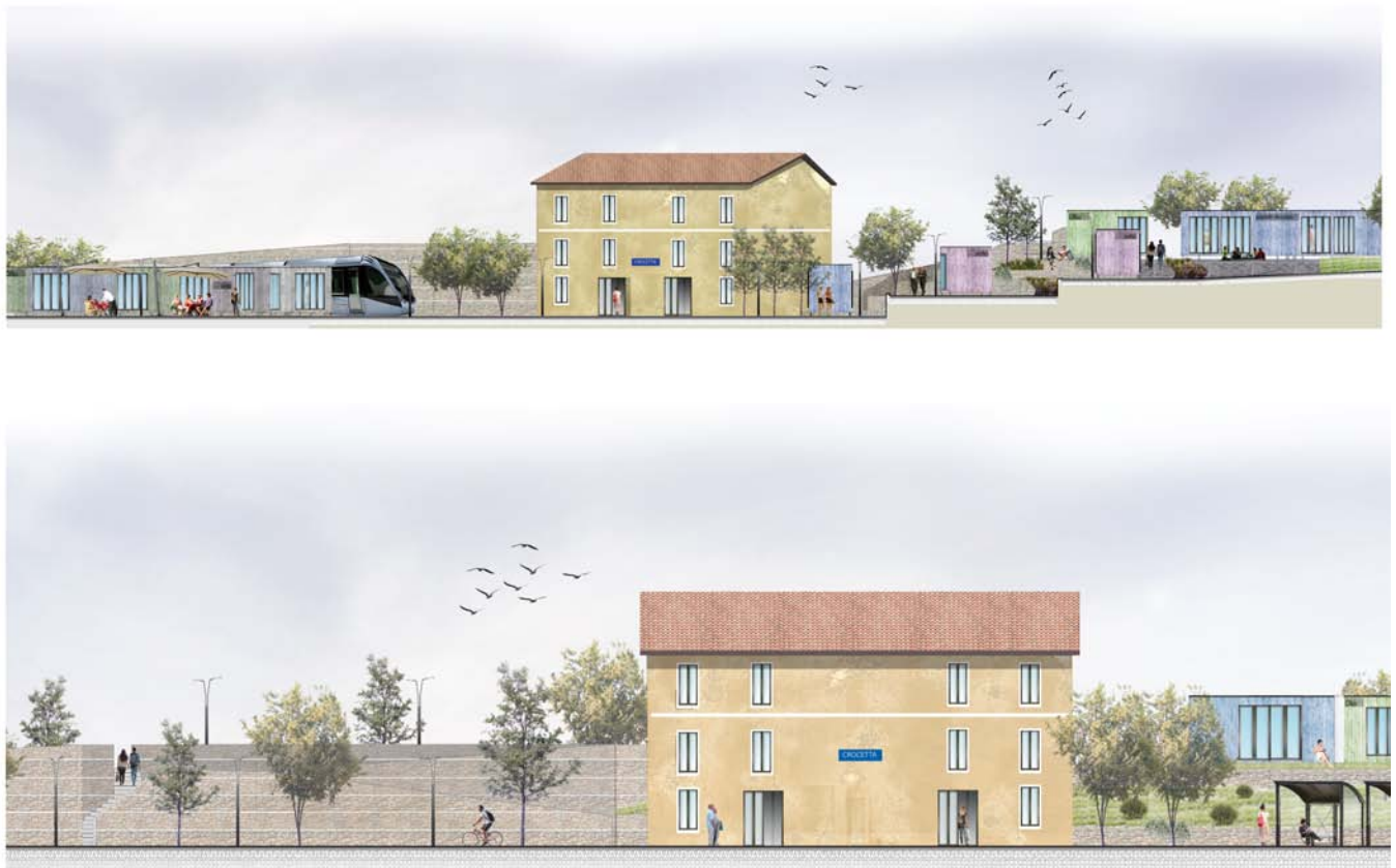
Figure 4: The Near Zero Kilometers Community scenario. Analysis of local products availability and hypothesis for a zero km food market along the decommissioned Sangritana railway.