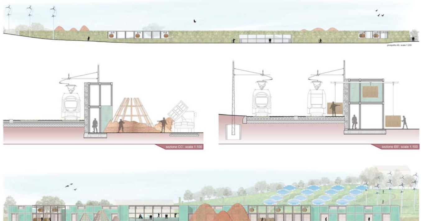
Figure 5: The Near Zero Energy Community scenario. Analysis of renewable energy resources (solar, wind, biomass) and hypothesis for an integrated production center along the decommissioned Sangritana railway.