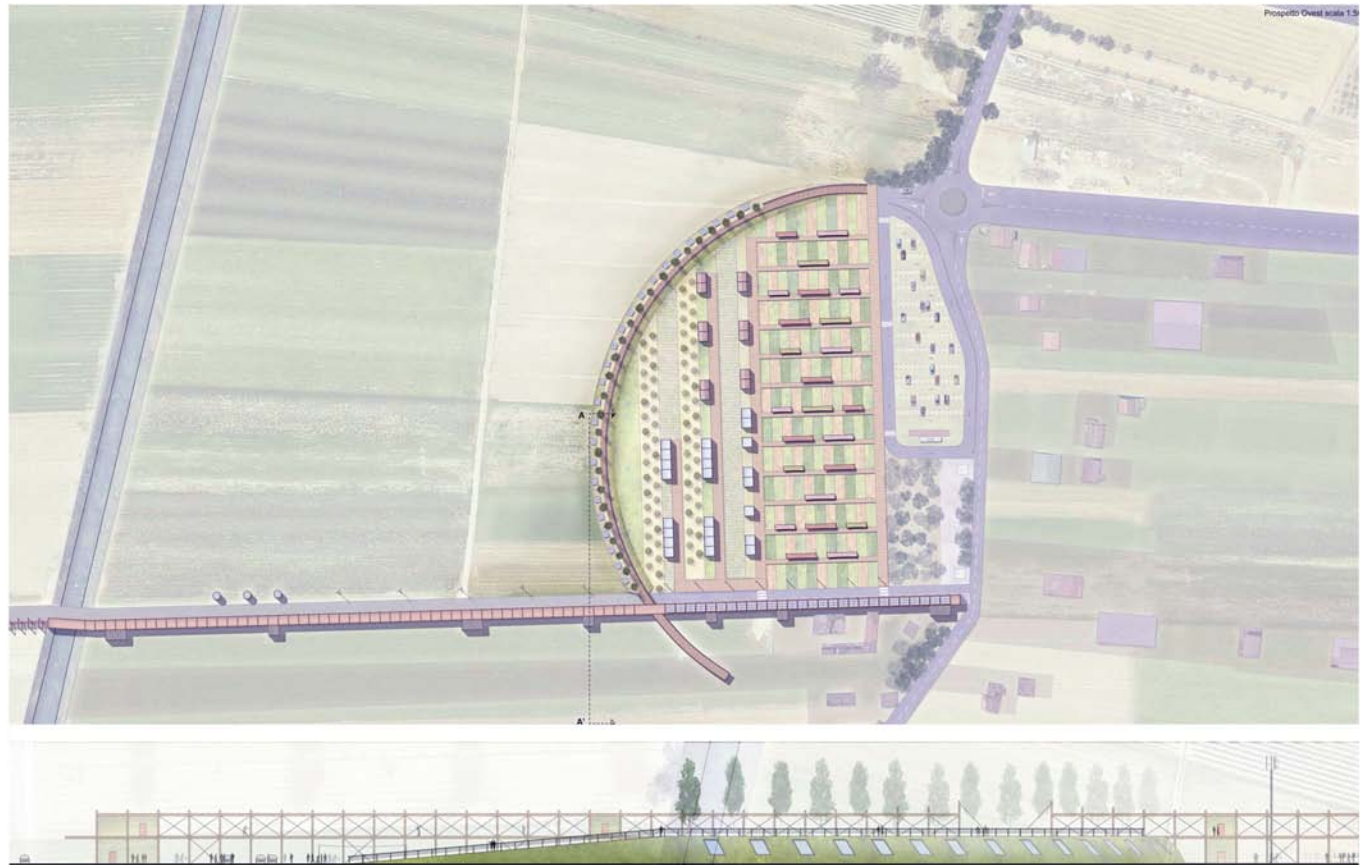
Figure 3: The Hybrid Rural Infrastructure scenario. Example of integrated IE system in Abruzzo agricultural landscape.

Source: Master degree thesis “Scenari tecnologici per la piana del Fucino: due ipotesi di intervento per il territorio agricolo di Celano”, G. d’Annunzio University of Chieti-Pescara, author, F. Aveani; tutor, F. Angelucci.